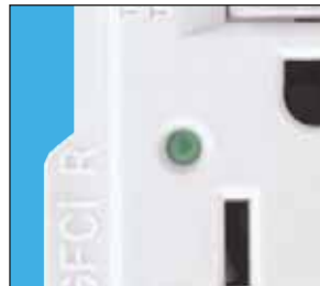
Optional LED indicator offers visual confirmation of power availability