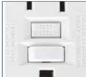
Lockout action blocks the "RESET" button if GFCI protection has been compromised