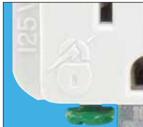
Look for the Lock when choosing a GFCI. The lock ensures improved GFCI performance