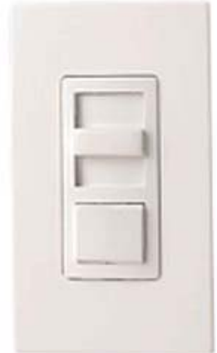
IPX06-1AW with optional wallplate